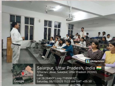
Salarpur, Uttar Pradesh, India 772xrvw, Javar, Salarpur, Uttar Pradesh 203203, India Lat: 28.26483°N Long: 77.650632°E Saturday, 09/11/2025 11:23 AM GMT +05:30