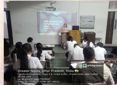
Greater Noida, Uttar Pradesh, India Cgwehho Kandrjga Vhary, Tower S-4, Pocket-4, Pk-1, Greater Noida, Uttar Pradesh 201515, India Lat: 28.44837°N Long: 77.57632°E Friday, 09/11/2025 11:24 PM GMT +05:30